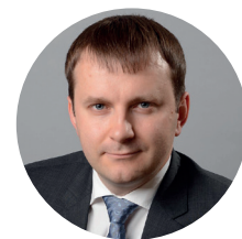
Maxim Oreshkin served as Deputy Minister of Economics and has since been appointed Minister of Economic Development of RF. He is a graduate of the HSE Faculty of Economic Sciences.

HSE's Alumni Association helps graduates to stay connected. Alumni participate in the university's seminars and conferences and have free access to HSE's library. In addition, they often hold their own events in conjunction with the university and offer current HSE students internships at their companies. Each year, the Alumni Association recognizes the achievements of particularly successful graduates at the Alumni Awards ceremony.